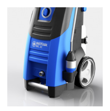
Automatic Start/Stop feature starts and stops the motor when the spray trigger is engaged or released – reducing noise during pauses and lowering pump wear and tear.