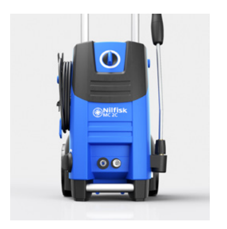
Smart, ergonomic construction and design with a convenient detachable sprayer-tank allows for increased range of mobility and greater ease of use.