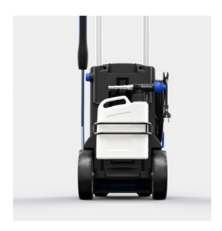
Convenient rear storage compartment for easy access and sturdy containment of the detachable combination foam cannon and 2.5-litre solution tank.