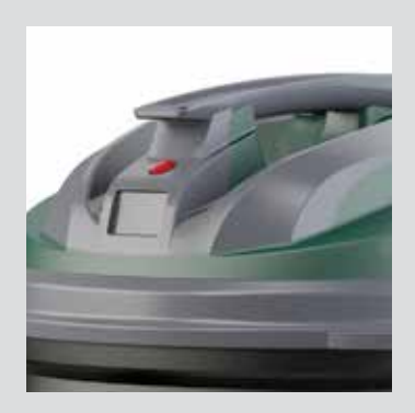
Bag full light Full bag indicator tells operator when it's time to change bags.