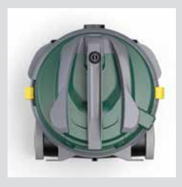
Quiet operation Speed regulator allows for noise adjustment, and non-marking rubber wheels travel over hard floors quietly.