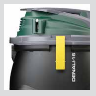
Detachable cord Minimize downtime with easily changeable cord.